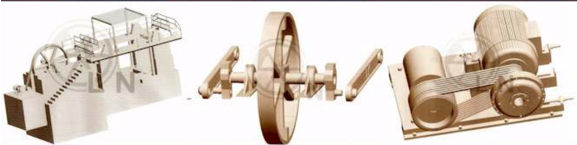
Gang saw Foundation