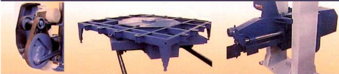
Main Motor Assembly